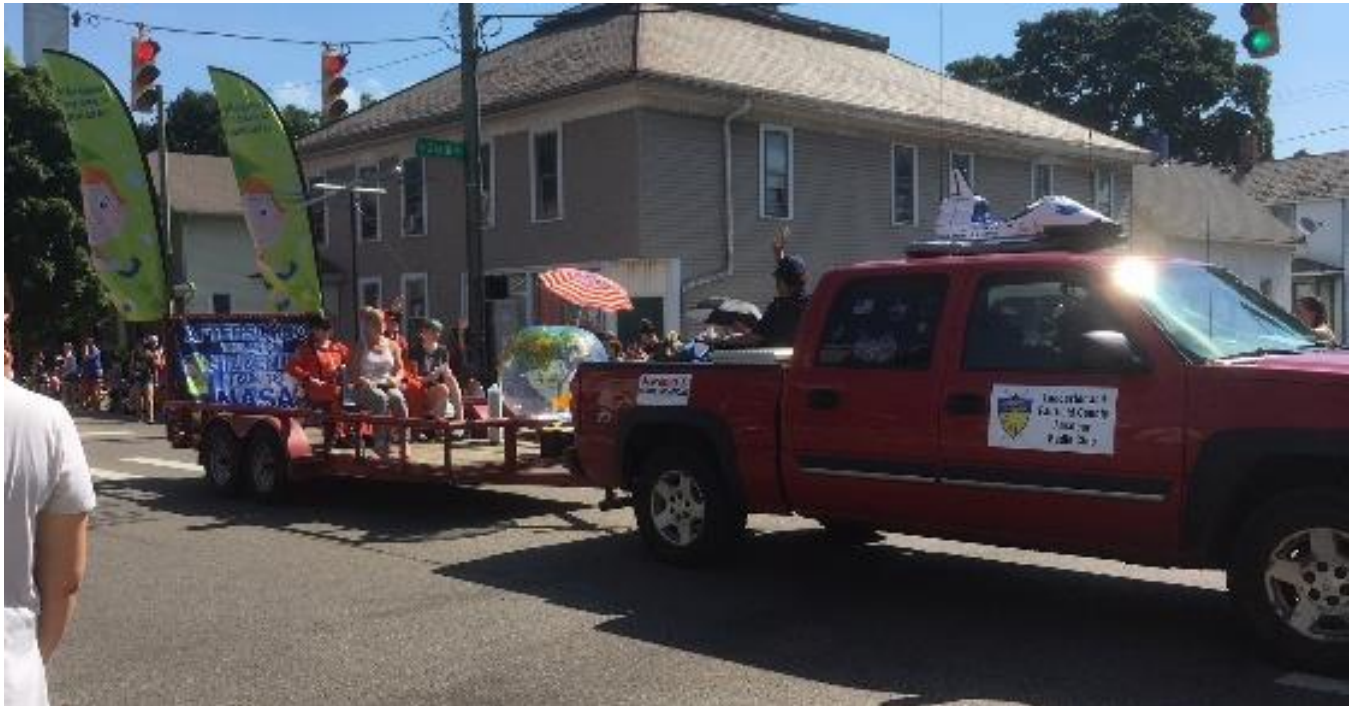
Here is a photo of the Lancaster After School Program float with astronauts sitting on the float. Pulling the float was a truck driven by one of the Lancaster-Fairfield County ARC members with a simulated space ship on top.